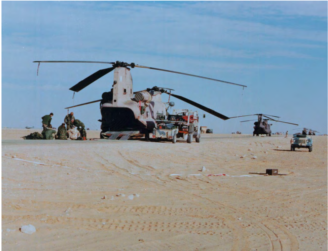
Chinook helicopters at a forward operating base; RAF helicopters supported the British Army on the battlefield