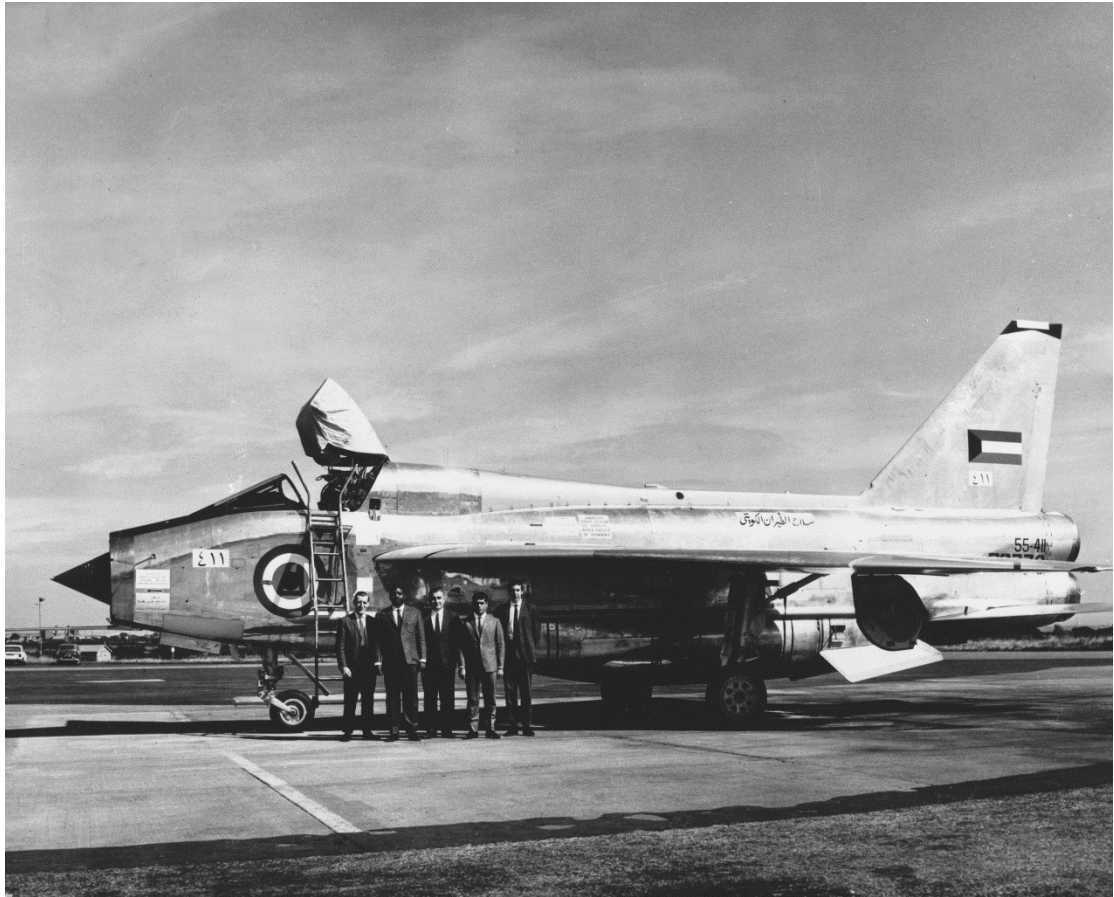
The handover of one of the first Lightning T.55 aircraft for the Kuwaiti Air Force in 1969