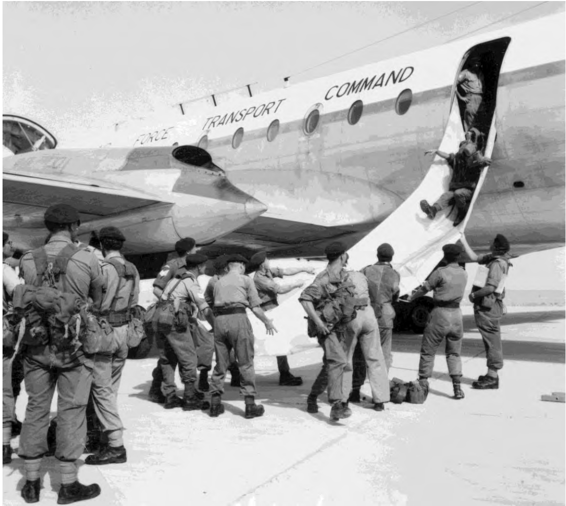
2 Para arrived in Bahrain from Cyprus; the airport lacked suitable steps so the troops had to slide down from the aircraft door