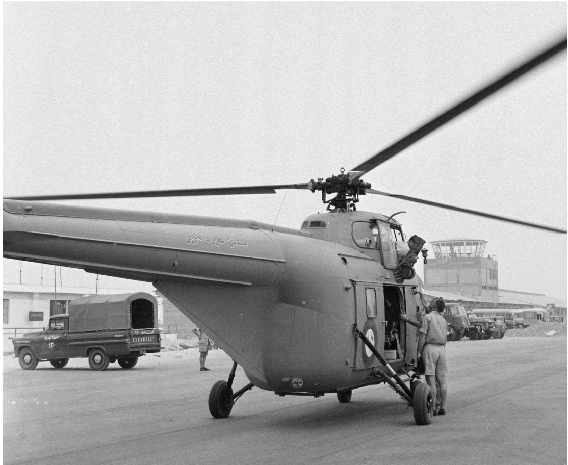
Four Kuwaiti Westland Whirlwind helicopters helped in the move of troops and equipment