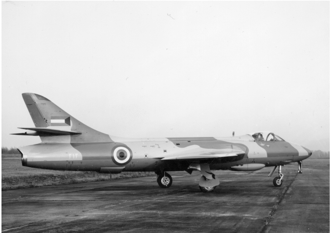
The Kuwaiti Air Force received its first Hawker Hunter aircraft in 1964