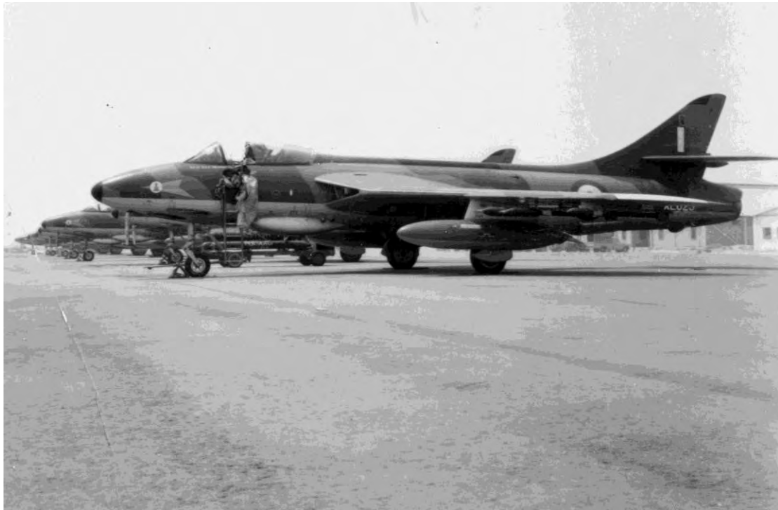
Hunters of 208 Squadron; 8 and 208 Squadron arrived in Kuwait on 30 June

Sharjah returned to Germany but Canberras in Cyprus were placed on standby. Slowly the remaining units withdrew to their normal locations and the Arab League introduced a small force to Kuwait. Steps were also taken to strengthen the Kuwaiti Army and create an Air Force of its own.