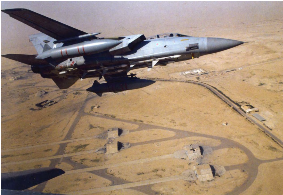
Tornado F.3 aircraft helped patrol the Southern No Fly Zone

The international community grew tired of the actions of the Iraqi Government, towards both their neighbours and own people. Calls for Hussein's removal from power grew stronger until an American-led force entered Iraq in 2003 and captured him. British participation in these operations was codenamed Operation Telic. It ended in 2009 and was replaced by Operation Kipion, the withdrawal of British forces from Iraq. Soon after the invasion was completed the RAF was able to withdraw from Kuwait to a new base in Qatar. Although the RAF has gone it remains committed to protect the freedom of the people of Kuwait.