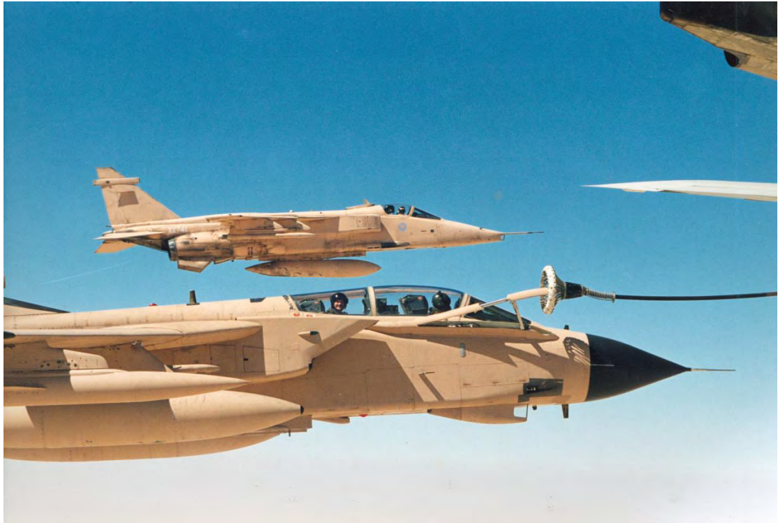
Tornado GR.1 and replacement Jaguar aircraft were flown to Bahrain and Saudi Arabia