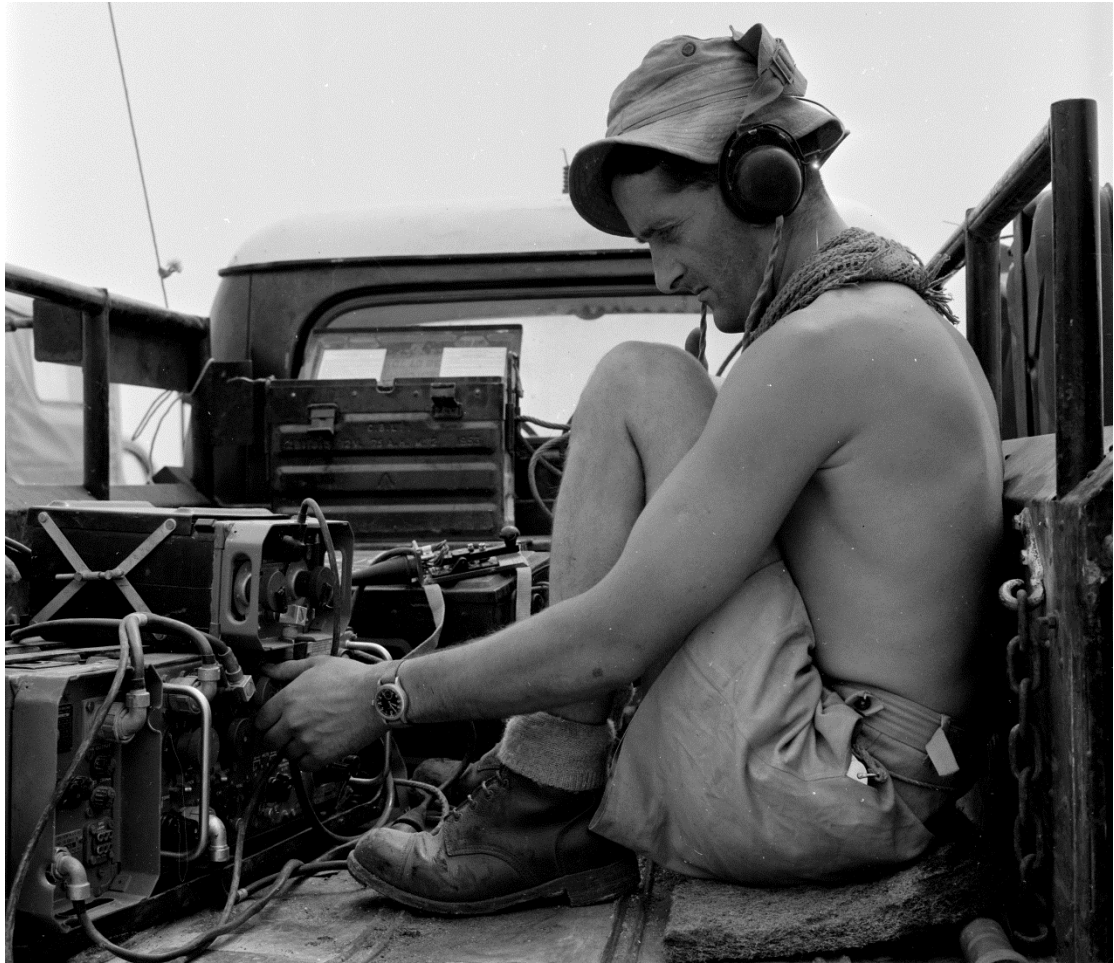
Communications between the British Headquarters in Bahrain and the forces in Kuwait was difficult