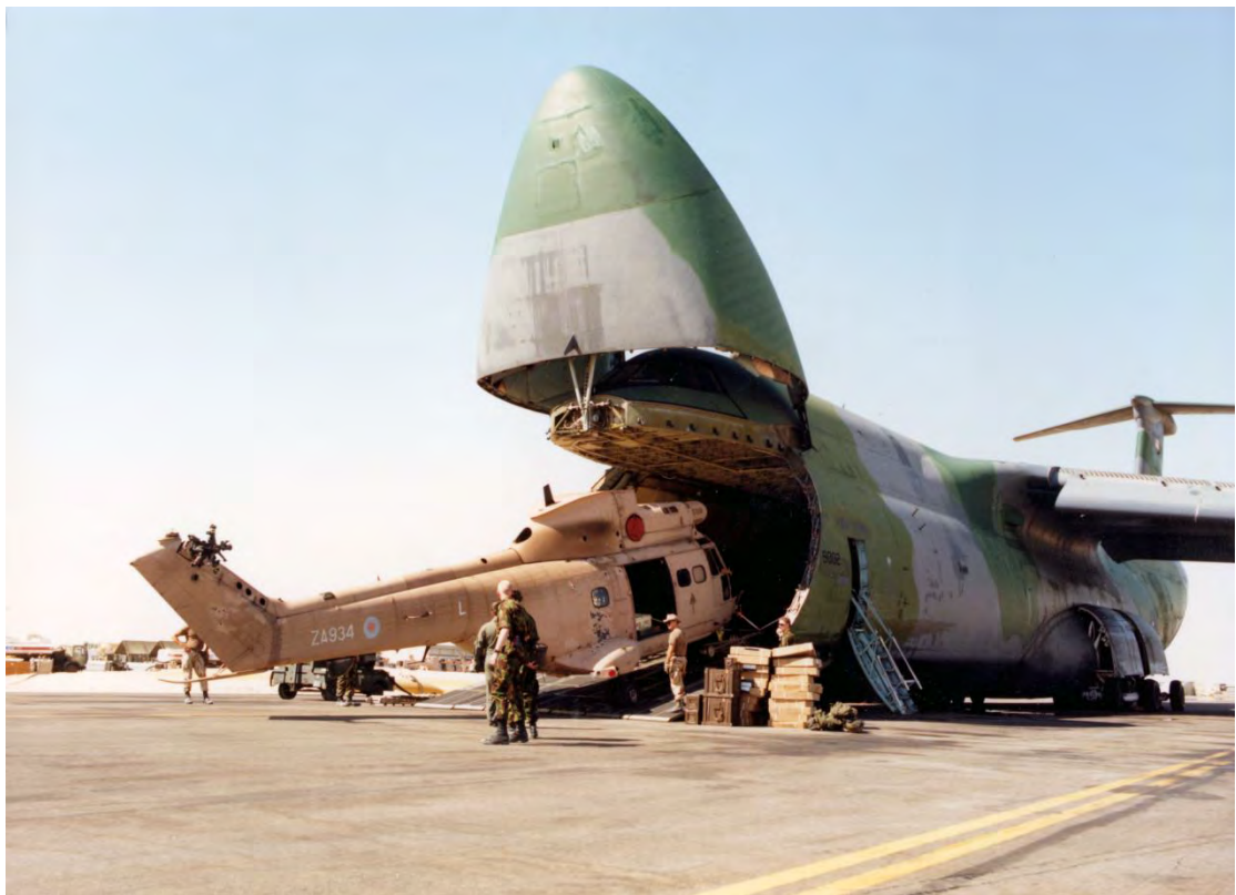
RAF helicopters were ferried to the Arabian Gulf in C-5 Galaxy transport aircraft of the US Air Force; others arrived by sea