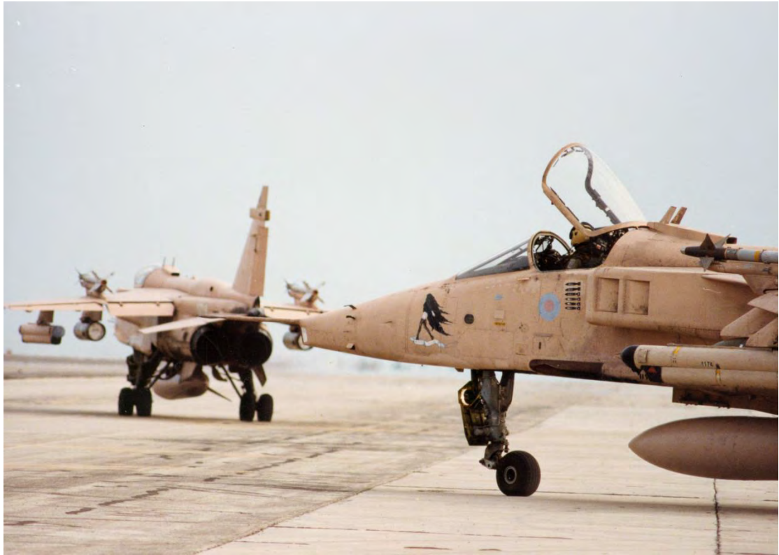
Jaguar aircraft attacked Iraqi forces in Kuwait; these are armed with Canadian CVR-7 rockets