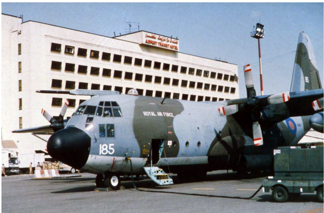
Three RAF Hercules aircraft were the first fixed-wing aircraft to land at Kuwait International Airport after its liberation