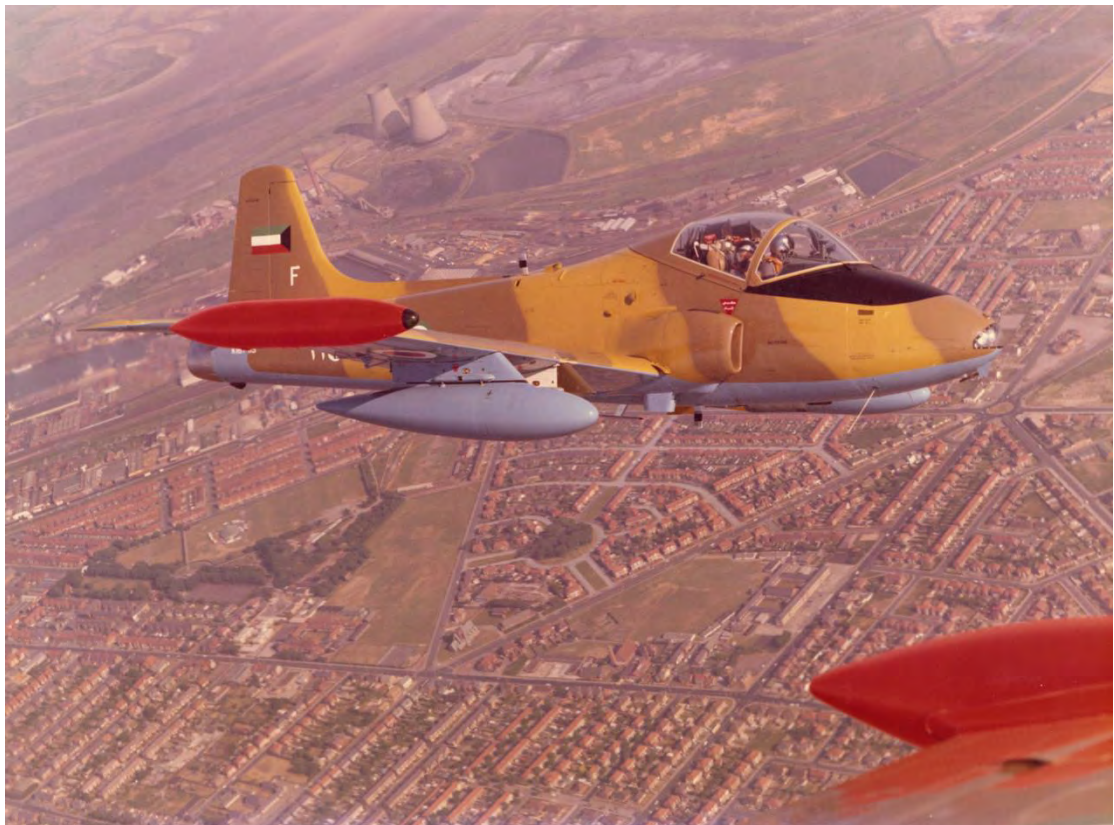
The Strikemaster was used in the ground attack role