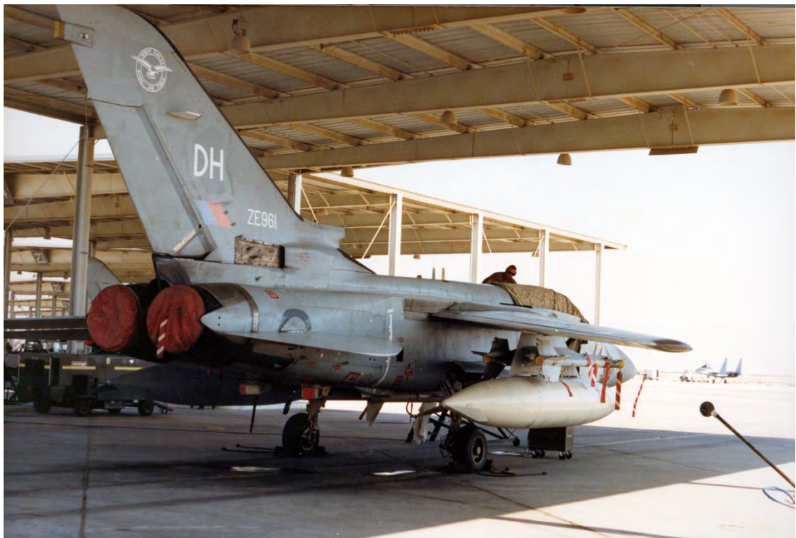
The first RAF aircraft to arrive in Saudi Arabia were Tornado F.3 air defence fighters which had been on exercise in Cyprus