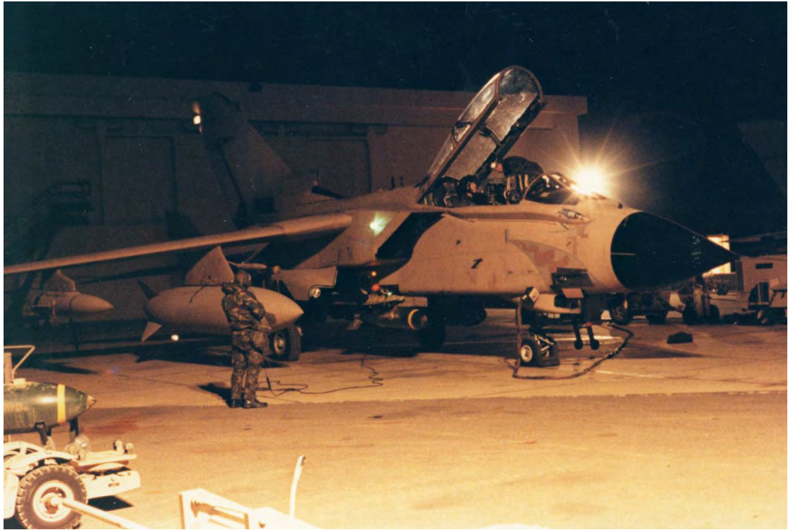
A Tornado at Muharraq, ready for a night sortie, armed with 1000lb bombs