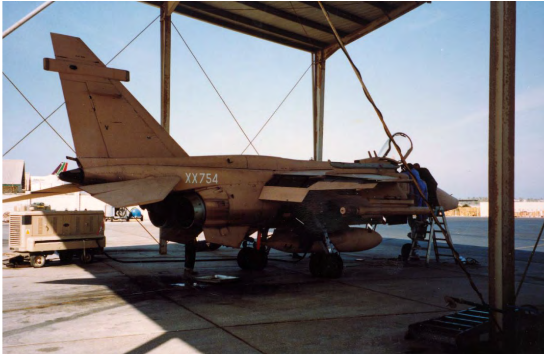
RAF Jaguar aircraft were first sent to Thumrait in Oman