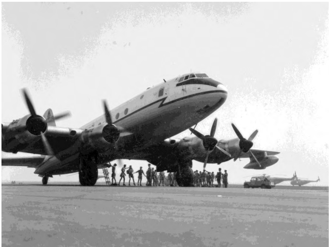
While troops unload this Hastings transport it has to keep two engines running because of the lack of ground equipment to restart the engines