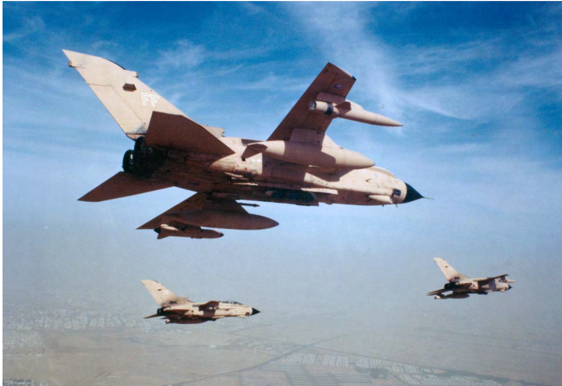
Tornado GR.1 aircraft; most of the early part of Operation Granby was spent training