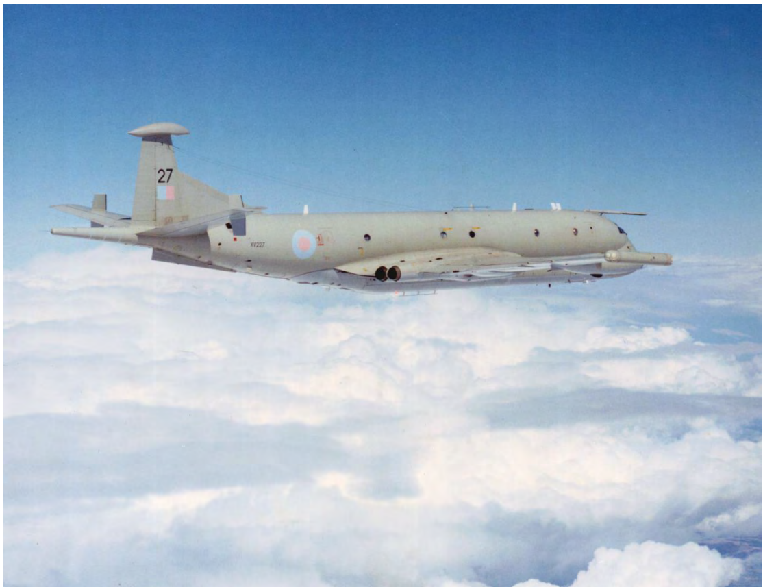
RAF Nimrod aircraft patrolled the Arabian Gulf during the Iran-Iraq War