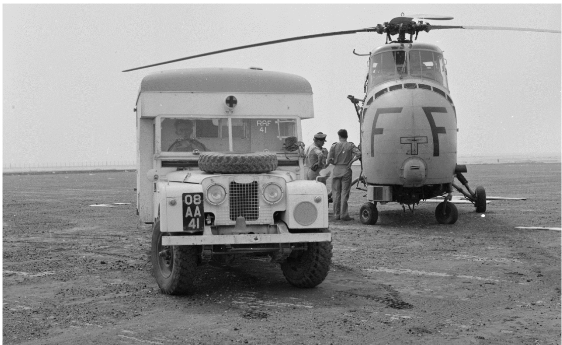
A Whirlwind helicopter from HMS Bulwark next to a RAF Landrover ambulance; the main cause of British casualties was the heat