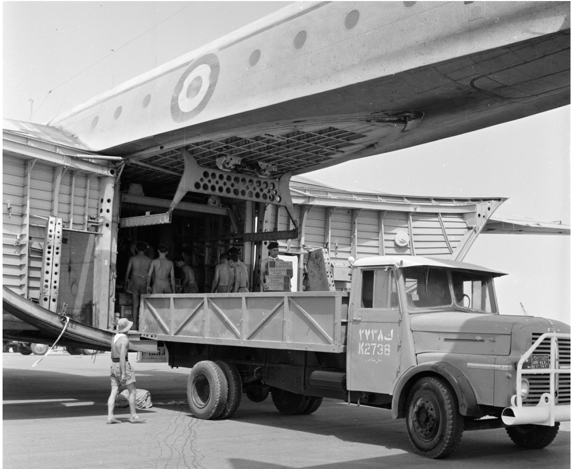
Kuwaiti authorities provided cars, lorries and cranes to assist the RAF unload and move stores and equipment