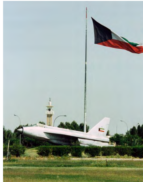
A Lightning gate guardian; by 1990 most of the British aircraft in the Kuwaiti Air Force had been replaced by French and American types