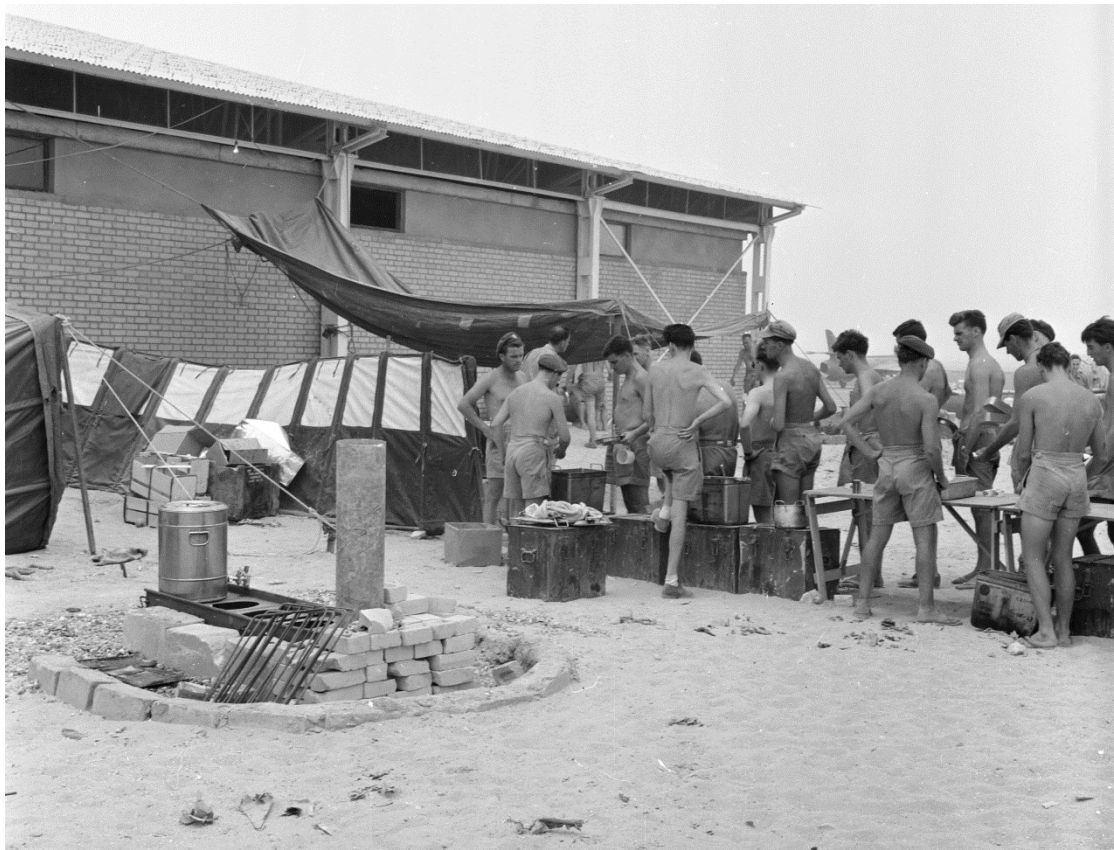
RAF personnel at a field kitchen; British forces had to provide their own facilities