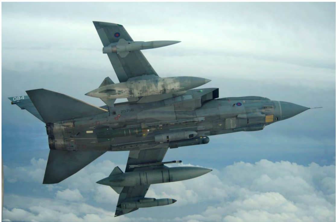
The Tornado GR.4 had replaced the Tornado GR.1 by the start of Operation Telic; this aircraft is carrying reconnaissance and targeting pods and a Paveway laser-guided bomb