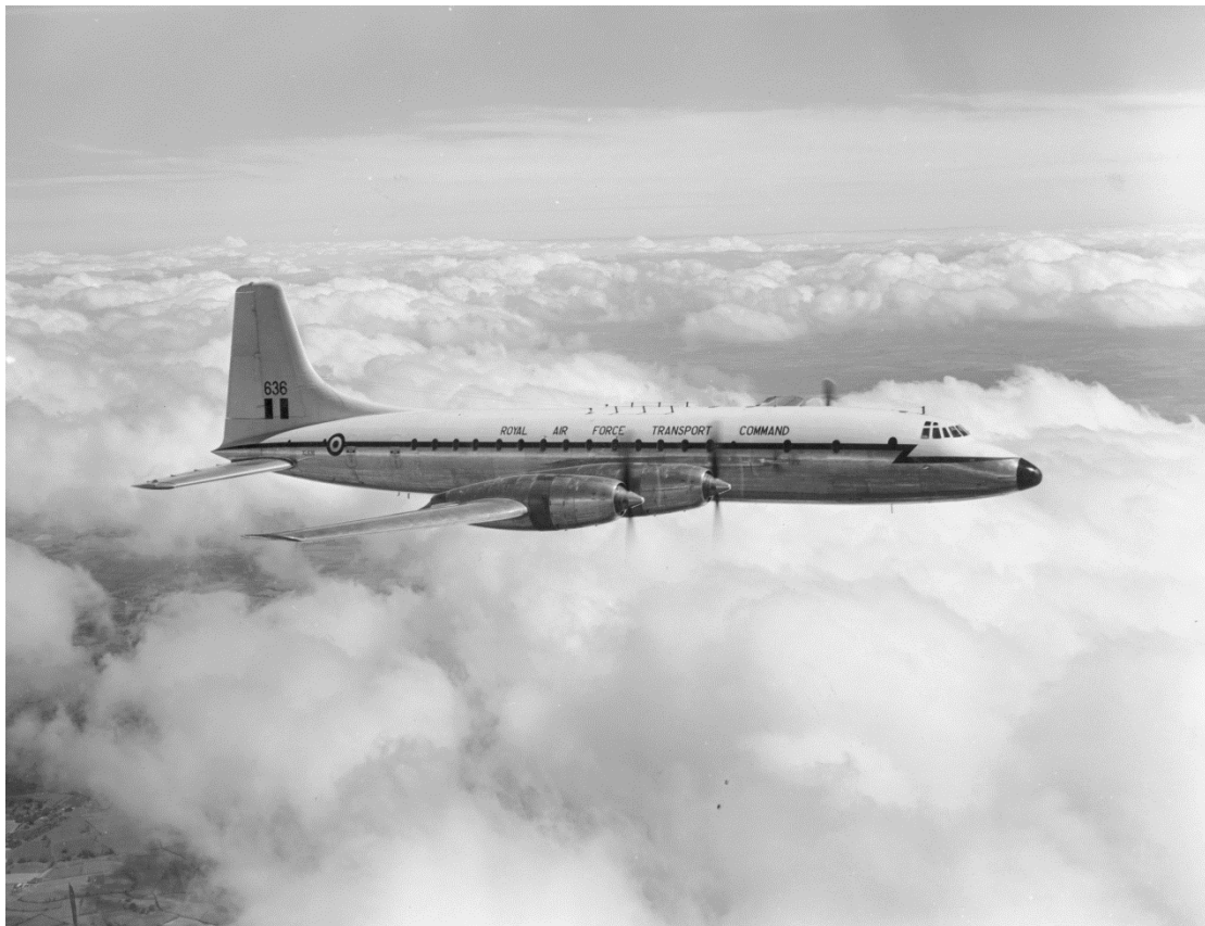
Bristol Britannia transports flew the men of 45 Commando to Bahrain from where smaller transport aircraft took them to Kuwait