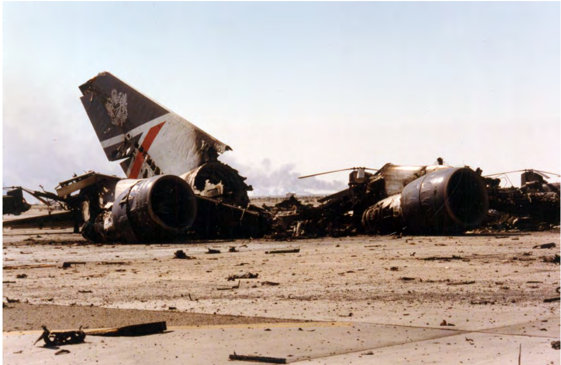
On 2 August a British Airways Boeing 747 landed at Kuwait International Airport hours after the invasion had started; its crew and passengers were taken hostage by the Iraqi Army