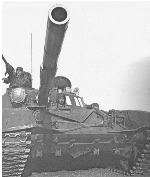
Kuwait was invaded on 2 August 1990

Despite losses incurred during the Iran-Iraq War Iraq still had the largest army in the Arab world. A build-up along the Iraq-Kuwait border was noticed but it was assumed this was just a show of force. On 1 August the Iraqi delegation left the talks in Saudi Arabia and the Iraqi Army invaded Kuwait at 0200 hours on 2 August. The Kuwaiti forces were overwhelmed, though some succeeded in escaping to Saudi Arabia. The invasion was denounced in the United Nations Security Council and the first of a number of resolutions passed, calling for an end to the illegal occupation of Kuwait. Instead of withdrawing Iraqi forces began to approach the Saudi border. On 6 August the government of Saudi Arabia made a request for assistance in defending its territory and on 8 August the Iraqi Government declared that Kuwait had become the 19 th Province of Iraq, the same day that Britain announced it would be sending forces to the Gulf to join the United States. Saddam Hussein assumed the Arab world would support him but instead found most joined with the western nations and wanted Iraqi forces to leave Kuwait.