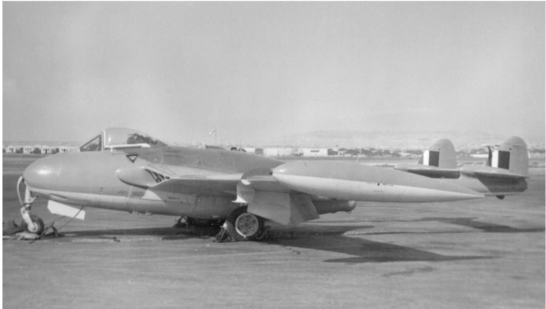
Before the RAF withdrew from Iraq it helped train the Iraqi Air Force which was re-equipped with modern aircraft including the Venom