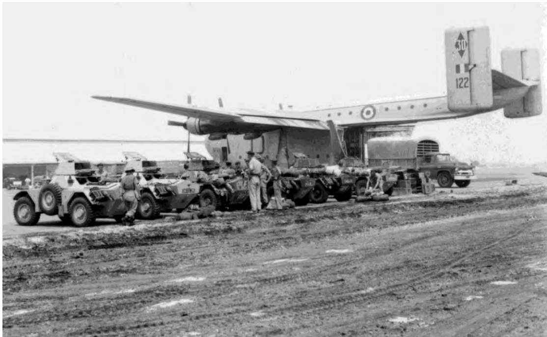
The Blackburn Beverley was used to fly troops and heavier equipment into Kuwait