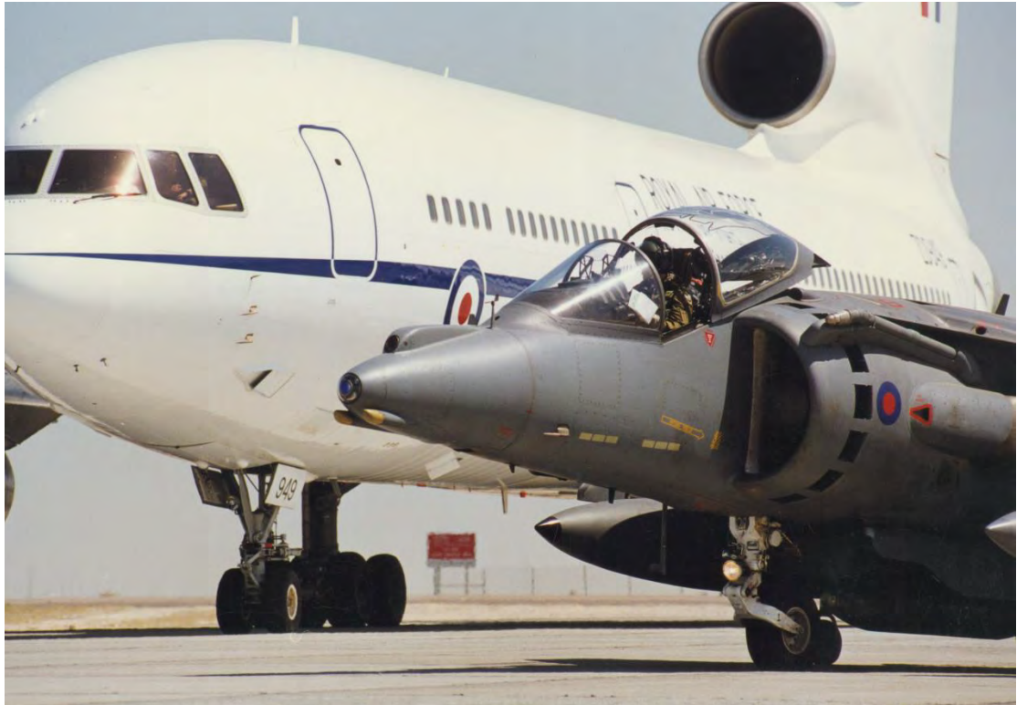
A Harrier taxis past a Tristar at Ali Al Salem Air Base in 1998, the first time RAF aircraft were permanently based in Kuwait