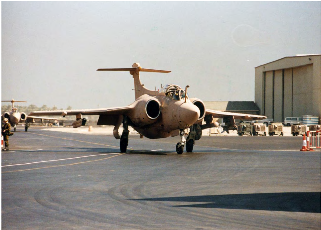
The arrival of the Buccaneer with the Pave Spike targeting pod enabled the RAF to use laser-guided bombs