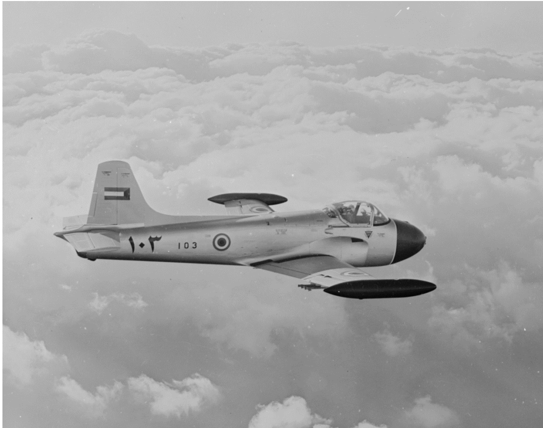
The first aircraft received by the Kuwaiti Air Force were six Jet Provost training aircraft in 1961