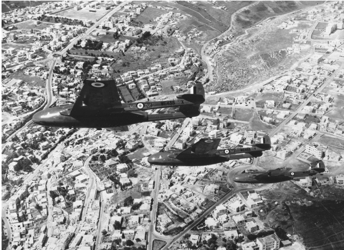
The De Havilland Venoms of 6 Squadron moved to Cyprus when RAF Habbaniya closed; Kuwait remained dependent on the RAF