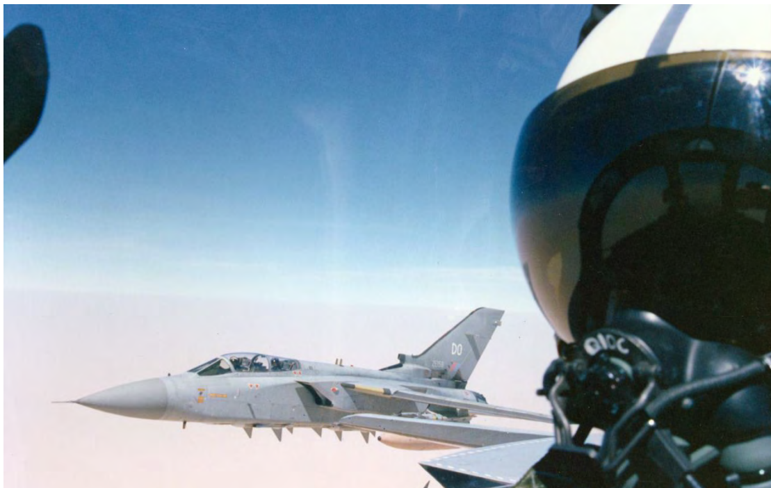
At the end of August 1990 replacement Tornado F.3 aircraft and crews arrived in Saudi Arabia, replacing the original detachment

The first RAF aircraft arrived in Saudi Arabia on 10 August to start Operation Granby, the RAF contribution to the multi-national coalition. Gradually over the next few months the size of the force grew, with Tornado and Jaguar ground attack aircraft in Bahrain and Tornado air defence and ground attack aircraft in Saudi Arabia. Hercules transport aircraft and battlefield support helicopters were also based in Saudi Arabia, ready to support the ground forces preparing to liberate Kuwait. On 29 November the United Nations Security Council passed Resolution 678, authorising the use of all necessary means to liberate Kuwait if Iraq didn't withdraw its forces by 15 January 1991.