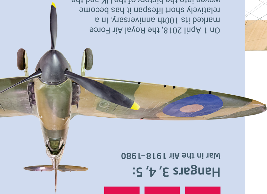
Hangars 3, 4, 5: War in the Air 1918-1980